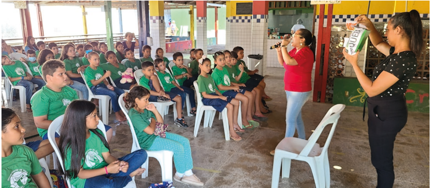
Children in a Univida classroom. (page 11)