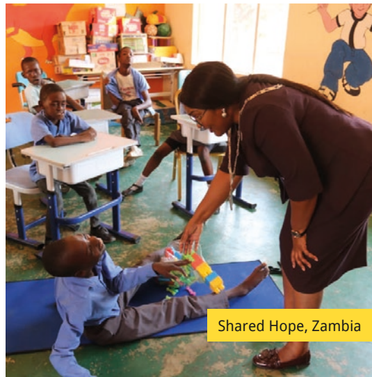
Shared Hope, Zambia