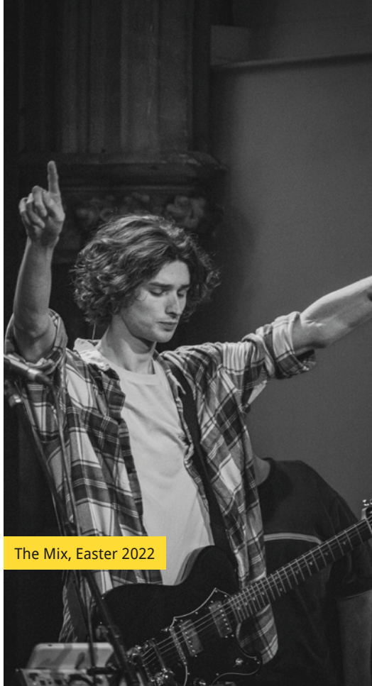
The Mix, Easter 2022