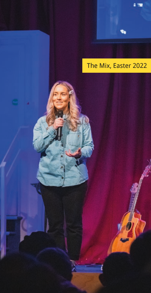
The Mix, Easter 2022